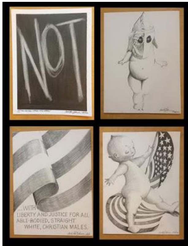
Carla Rae Johnson, from PTSD (Post Trump Series of Drawings) , 2017

Another installation from The Séance Series is a bridge made of rope and wood, 75 x 96 x 48 inches, which conceptualizes Audre Lorde Meets Abraham Lincoln , exhibited at Ceres Gallery in 2007. The artists wrote: "Lorde and Lincoln play 'bridge.' This bridge is not a card game, but a physical, symbolic span across an obstacle. I think Audre Lorde would have confronted Lincoln on issues of race, power, and privilege, so it is Lincoln who must build the bridge. Not a straightforward crossing, this is a difficult, jagged transition; composed of huge steps, twists, inclines, and internal tensions. At the top of the center of the crossing is a "spirit-level" symbolic of the quest to equalize and create a more level ground. Beneath the bridge sits the 'house.' Emblematic of the existing social structure, 'the master's house,' is the obstacle that must be bridged with understanding and common ground, level ground, so that together Lorde and Lincoln can dismantle its walls and work toward a just future." Both Please Touch Vesuvius and Audre Lorde Meets Abraham Lincoln speak to Carla Rae's commitment to feminist issues and social justice.